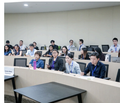
Our Tech Graduates at the GenReady Job Fair