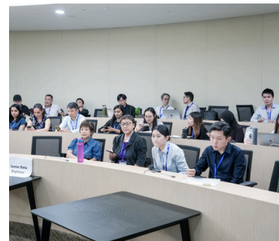
Our Tech Graduates at the GenReady Job Fair