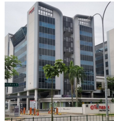
Temasek Polytechnic East Wing Block 1A